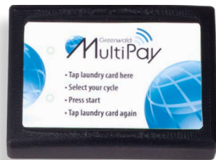
Contactless MultiPay Machine Reader

Add MultiPay Contactless or Contact Machine Readers, and Greenwald Pay phone app to give your customers multiple payment options