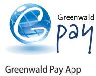
Greenwald Pay App