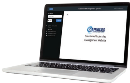
Greenwald Management System

Get Analytics, Machine Data/Telemetry, and Up-to-the-minute reporting by using Greenwald' Management System