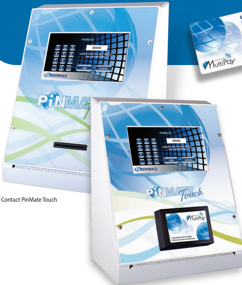
Contact PinMate Touch

Greenwald Industries' PinMate Touch provides a low-cost solution for registering and adding value to SmartCards. The Pin Generation System accepts cardholder's payment by web interface, and provides a secured pin number to encode a purchased value. Lightweight unit mounts to any surface.