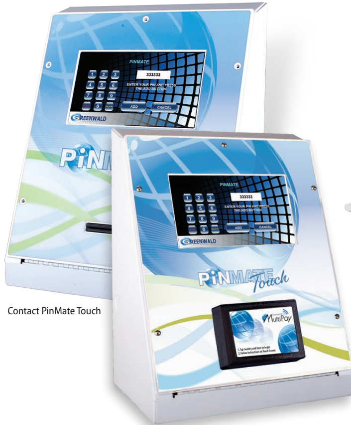
Contact PinMate Touch