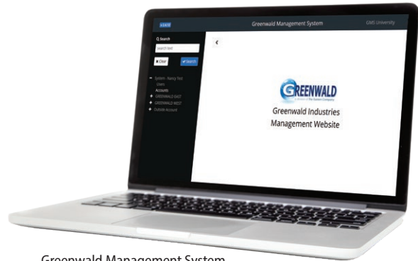
Greenwald Management System

Include one of our our exclusive PinMate Touch cash-less add value Kiosks or choose from a Touch Screen Cash or Credit Kiosk.