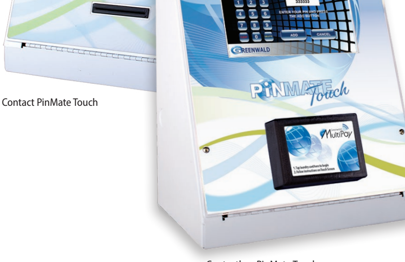
Contactless PinMate Touch