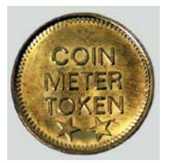
118-1 Round .880" (22.3mm)