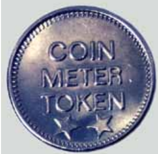
118-10 Double D .940" (23.8mm)