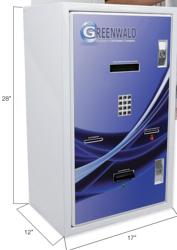
Ultra-High Security Cash Box

Greenwald Industries' Ultra High Security Cash Add Value Station manufactured from heavy duty cold rolled steel delivers the protection you need to process cash transactions in locations where credit card processing is not an option. The Ultra High Security Cash Add Value Station provides you the comfort of knowing your cash is secure between collections. Accepts $1.00 $5.00 $10.00 and $20.00 denominations.